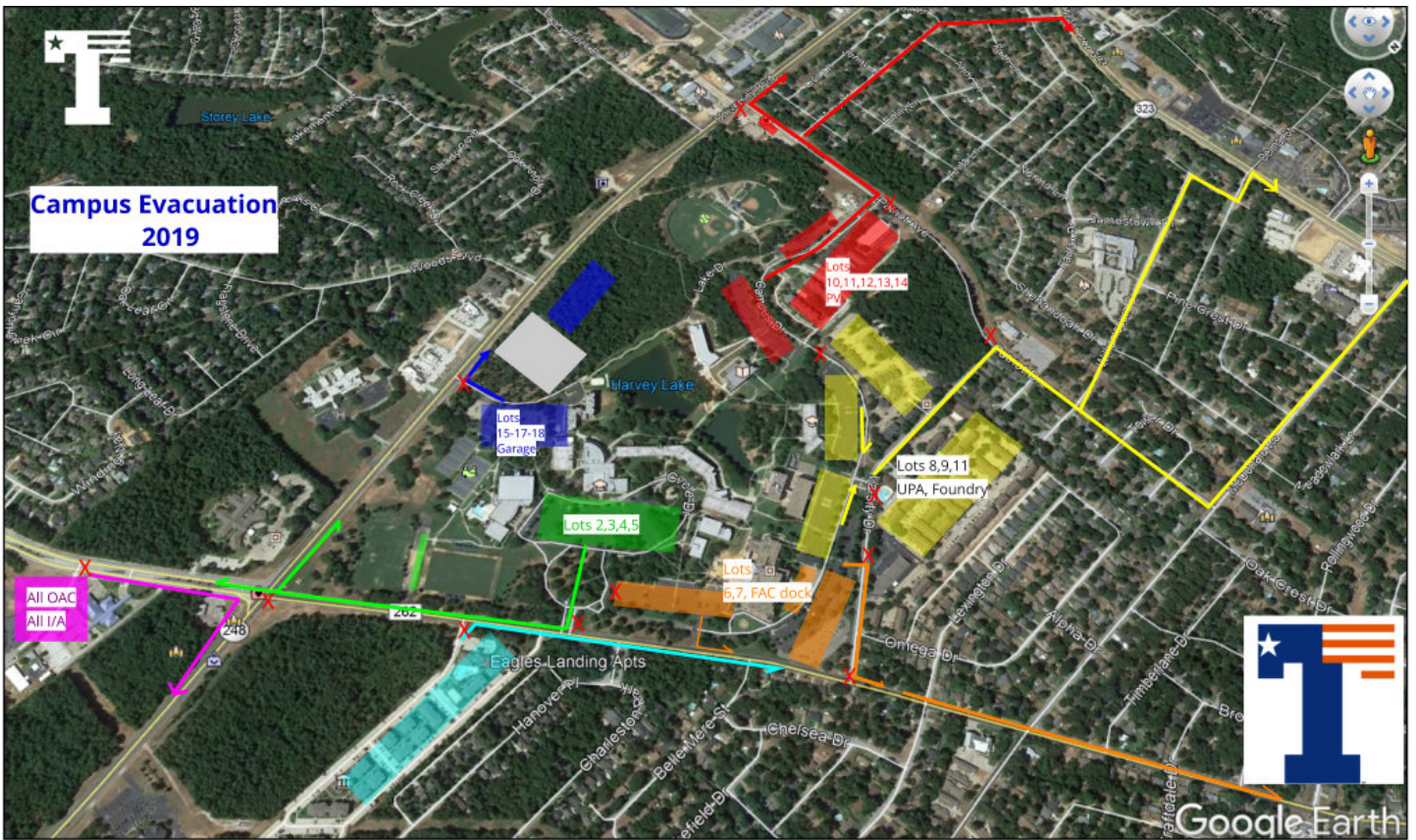
UT Tyler Police Department - Campus Evacuation Plan